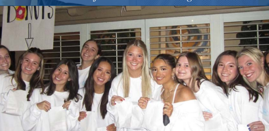
Kappas working hard at their Krispy Kreme with KKG event supporting Mental Health America!