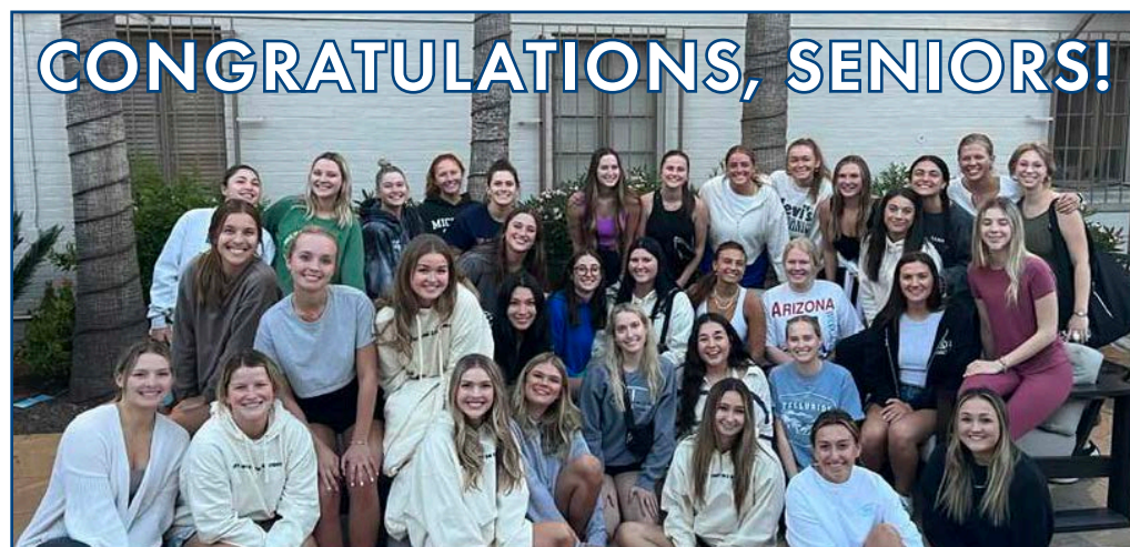
The KKG Alumnae Association of Tucson hosts a wonderful evening to welcome Gamma Zeta seniors as new alumnae.