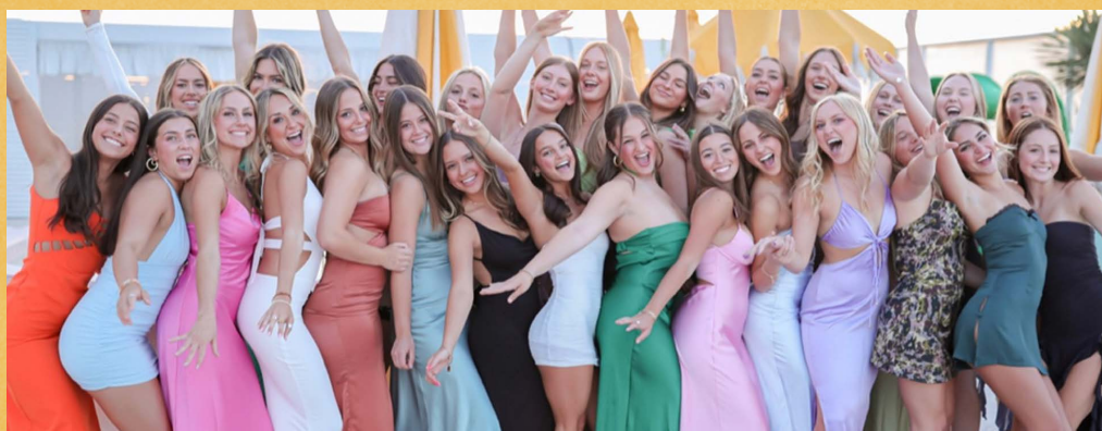
The 2022 pledge class during spring formal!