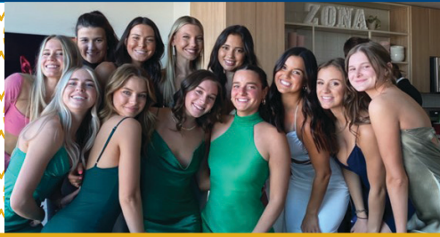
Members of the 2021 Gamma Zeta class before our Spring Formal on April 21, which took place at Zen Nightclub in Tucson.