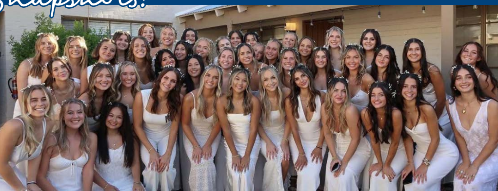
Seniors looking beautiful before preference round in September.