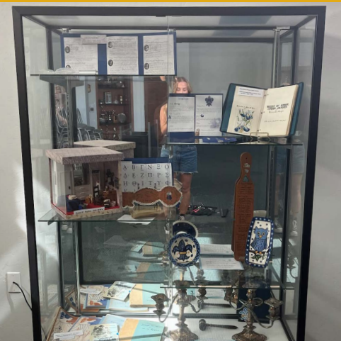
Celebrating a slice of Gamma Zeta history with our new display cabinet!

If you prefer to mail a check, just follow the instructions on the enclosed envelope. Thank you for your support!