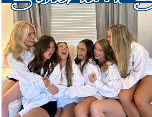
These six Kappa roommates celebrate fall move-in!