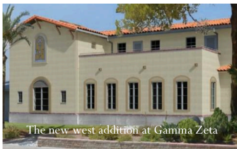
The new west addition at Gamma Zeta