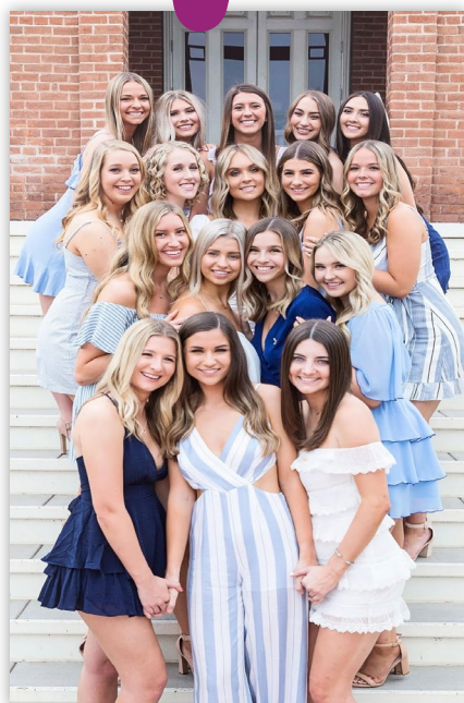
2019 Chapter Council