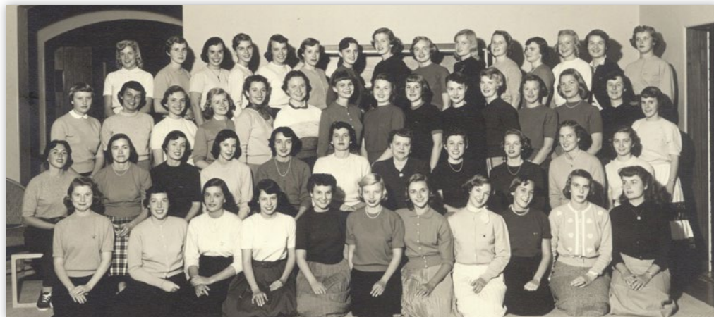
1952 Active Pledges

What a wonderful and once in a lifetime opportunity to celebrate and reconnect with college friends. The memories of those 4 years are sure to come flooding back to life as you visit and reminisce about your "good ol' Kappa days". We so look forward to seeing you at the Gamma Zeta Centennial Celebration!!